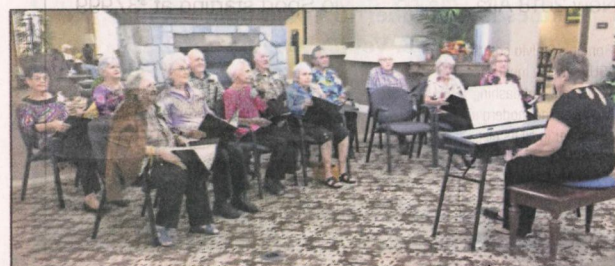
The Tuscan Gardens Tuscanaires perform for about 50 friends and family. The concert included familiar tunes, such as "Let Me Entertain You," "Moon River" and "New York, New York."